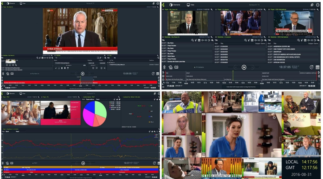
Images: Examples of custom dashboard layouts